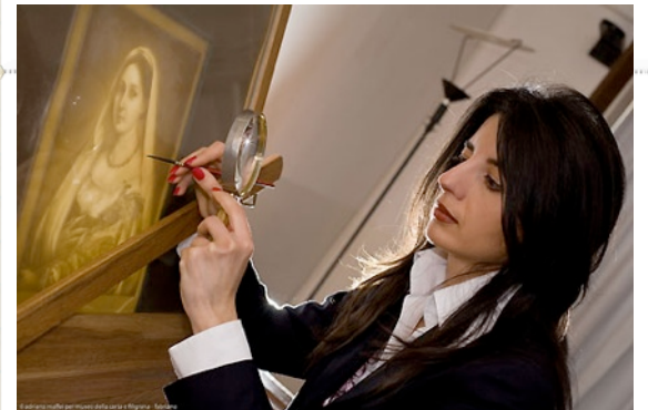
Watermarks were invented here