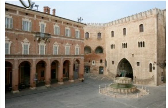
The museum piazza

NOTE should you wish to opt out of this trip you are free to explore locally or relax at the hotel instead. The studio will be open all day but tuition will not be provided. A lunch will be provided at the Il Collaccio restaurant.