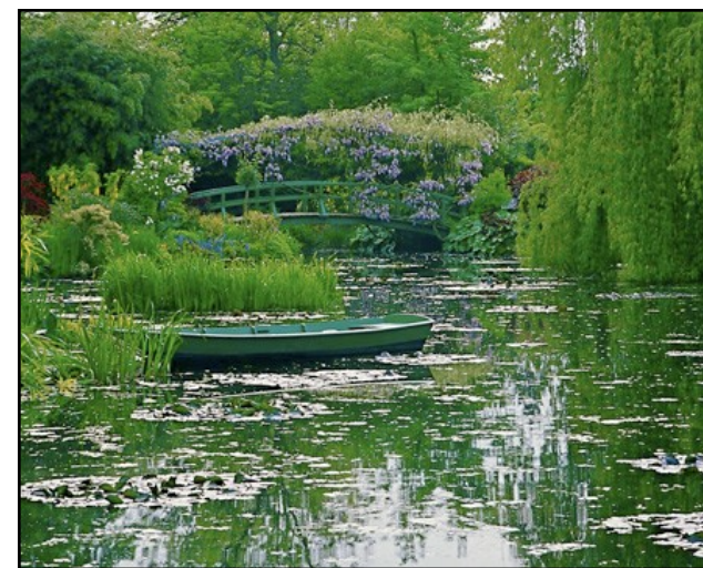
Bridge at Giverny, Monet's Garden by Elizabeth Murray ~ www.elizabethmurray.com