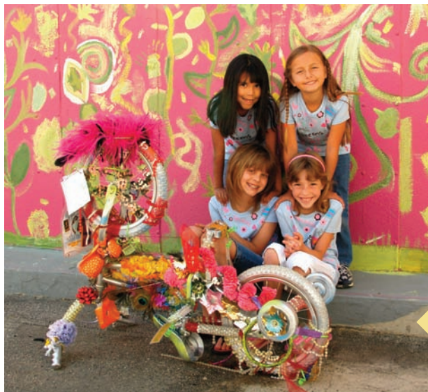
Brownie Troop 2022 Recycle Bicycle, 2009 EE Week Photo Blog Contest Winner.