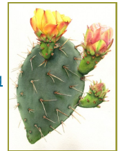
Below: Sunrise on the Pebble Plain , original watercolor of Munz's Hedgehog Cactus, a rare species threatened by off-road vehicles and cactus collectors. 1998

For more information about the meeting see the California Native Plant Society's website at cnpssd.org