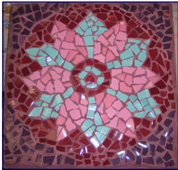
Mosaic Art created by students in Julie's previous Mosaic I classes at Mira Costa College. Each Mosaic is on a flat surface around 12 by 12 inches.