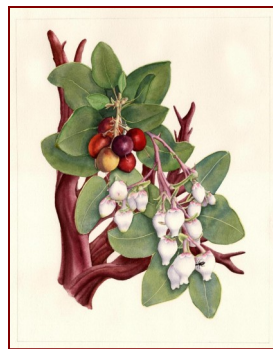
Big Berry Manzanita, Arc-tostaphylos glauca . 2003

The meeting will take place at Building #17 at Balboa Park in San Diego. The meeting will be a holiday celebration. There will be live music from 6:30 to 7:30. It is a member’s night, so instead of a guest speaker, members are invited to show slides of native gardens or their native plant travels. We also encourage attendees to bring appetizers or holiday deserts. Outstanding members will be recognizing with year end awards.